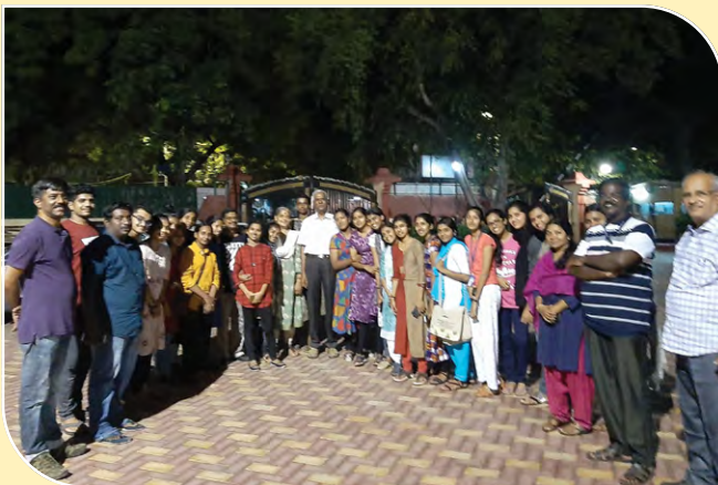
Team with D Raja, Gen Secy of Communist Party of India