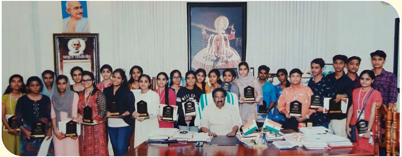
Best Parliamentarians with Hon'ble Parliamentary Affairs Minister