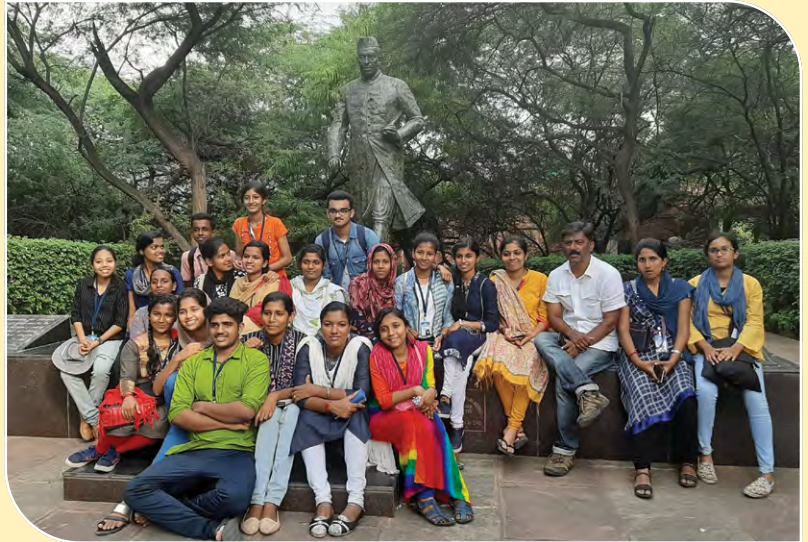
At Jawaharlal Nehru University