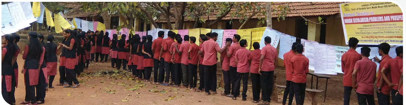
Govt. Boys HSS, Attingal conducted exhibition on Indian Secularism

To strengthen ideals of Parliamentary democracy and a sense of responsible citizenship among the students, the Institute of Parliamentary Affairs provides financial assistance to the establishment of Parliamentary Literacy Club