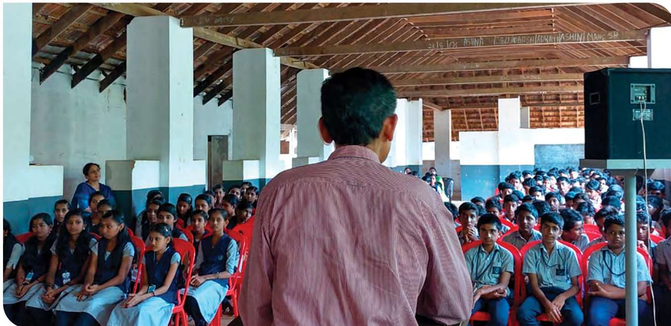
Seminar at Ganapathy Vilasom HS, Koovapady

Institute provided financial assistance to 37 schools to conduct seminars in the year 2019-20. The seminars enabled students to develop ideas about foundations of our constitution and parliamentary democracy.