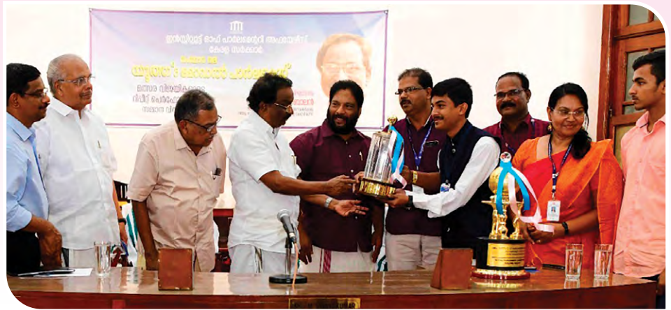
First prize of Youth Parliament Competition to GHSS, Navaikulam, Trivandrum