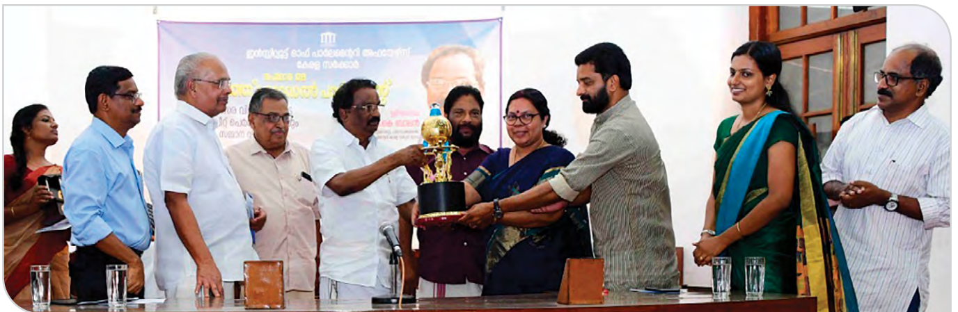
First Prize of Model Parliament Competition to NSS Training College, Ottappalam, Palakkad