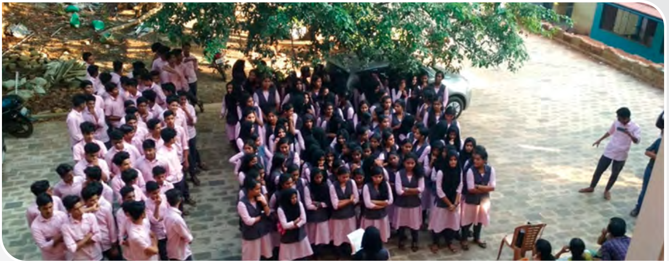
GHSS, Mezathur, Palakkad celebrating Constitutional Day