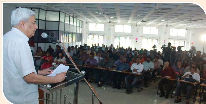
Inaugural address by Prakash Karat