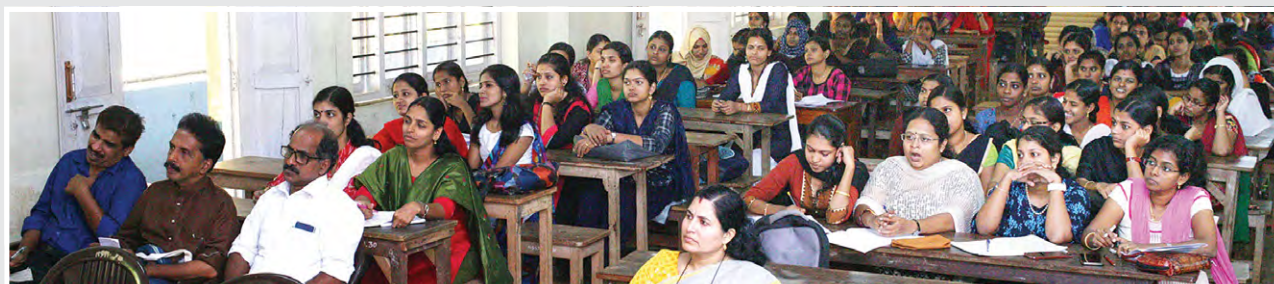
Seminar at NSS Training College, Ottappalam

In the year academic year 2019-20, one day seminars were conducted in 15 colleges and 8 colleges organized two-day seminars. Institute provided Rs. 25,000 to one day seminars and Rs. 50,000 to two day seminars.